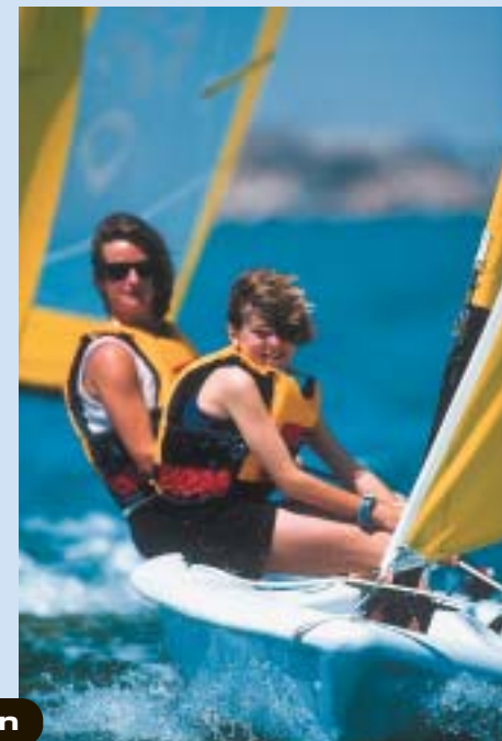
Race sail option

Families are pretty demanding! Laser Pico is built to take those demands in her stride. Year in year out. She is tough. Requires virtually no maintenance and is ready for action in minutes.